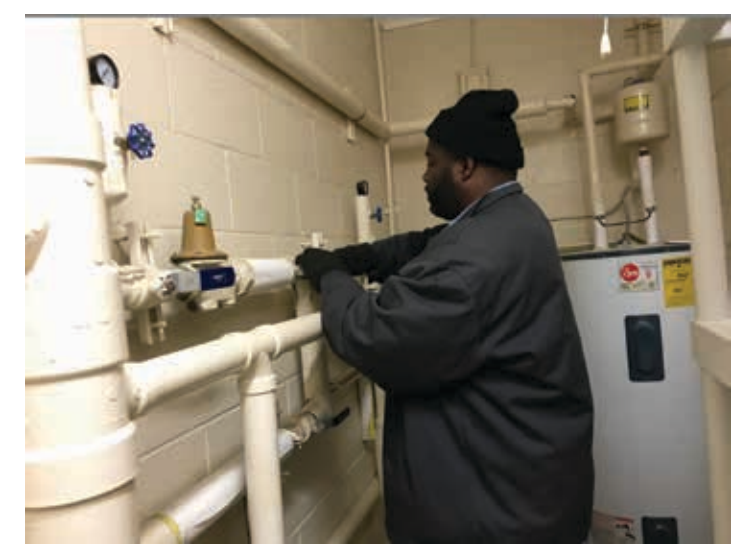
Draining water pipes at Milam Park.