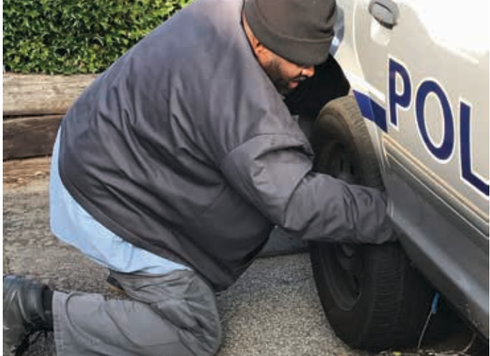
Installing and removing snow chains to Public Safety and services vehicles