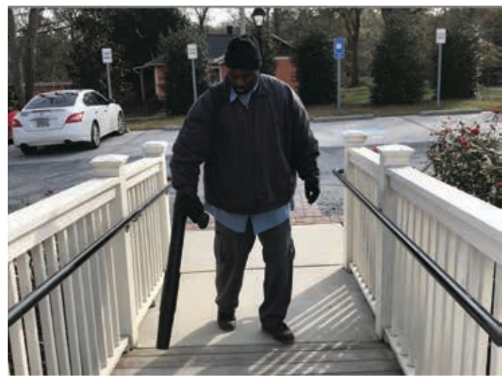
Salt and sand removal from driveways, walkways and sidewalks.

Salt and sand applied to driveways, walkways and sidewalks.