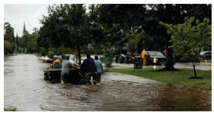
Flooding: A Frequent and Costly DisasterFlood risks have changed throughout the watershed due to erosion, land use, environmental conditions, and changes in runoff patterns.

The Open House was held on December 6, 2017 to give impacted residents, community members and business owners an opportunity to voice in-person issues, concerns, risks assessments and to ask aftermath questions about assistance and flood insurance.