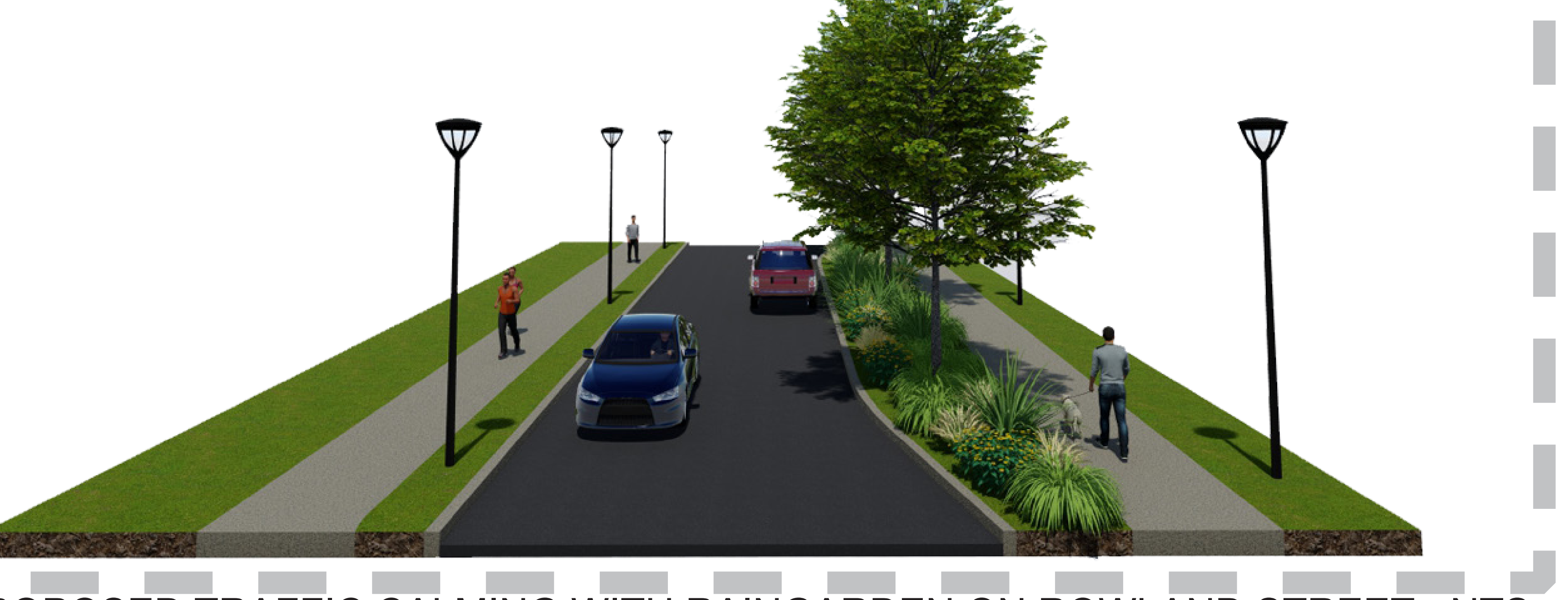
PROPOSED TRAFFIC CALMING WITH RAINGARDEN ON ROWLAND STREET - NTS